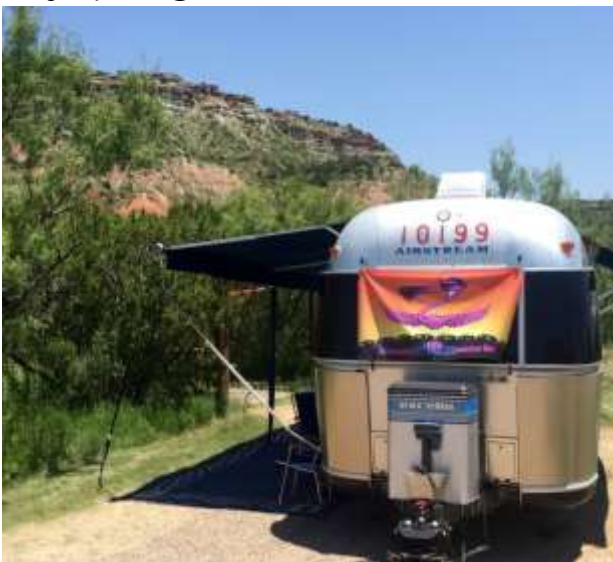
Camping in the Palo Duro Canyon State Pa 1