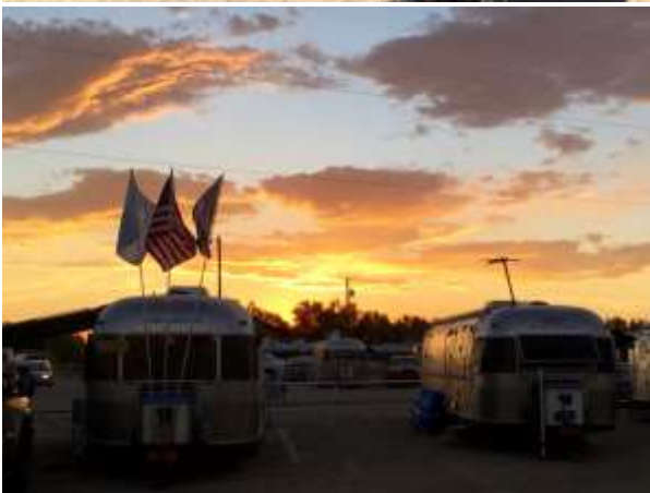
Sunset at the 2015 WBCCI International Rally in Farmington, NM