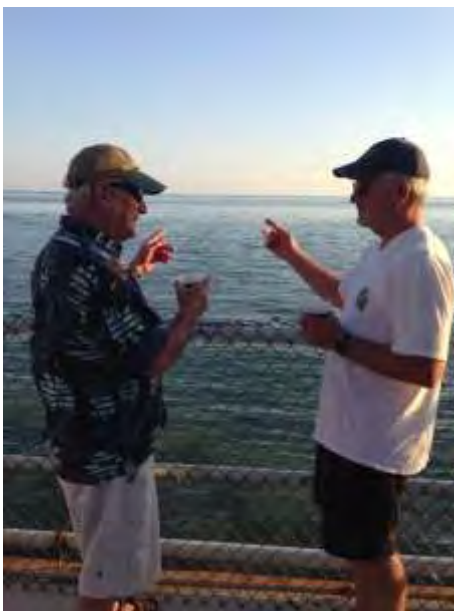
Business meeting Southeastern style