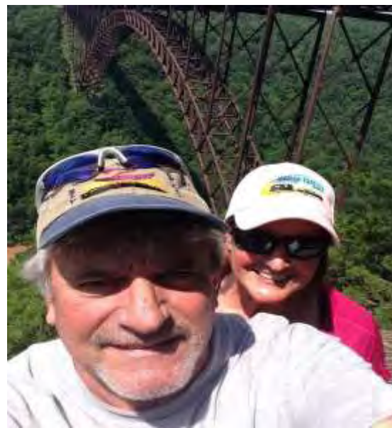
Hat Say...Don't look down!