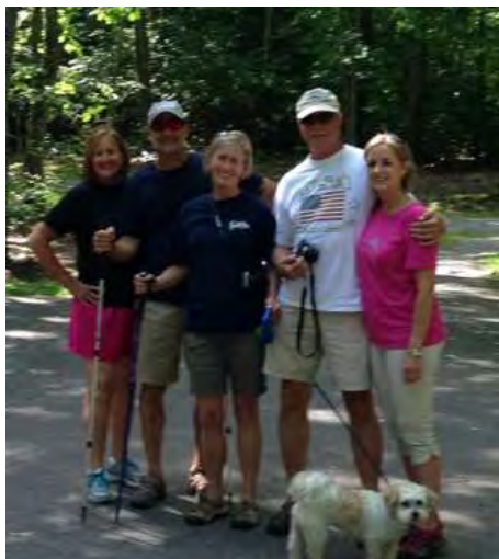
A walk with friends