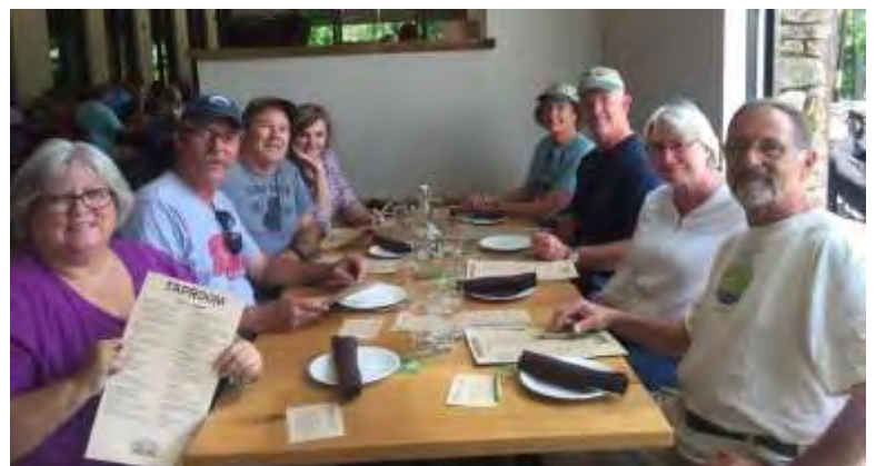
Sharing meals with friends